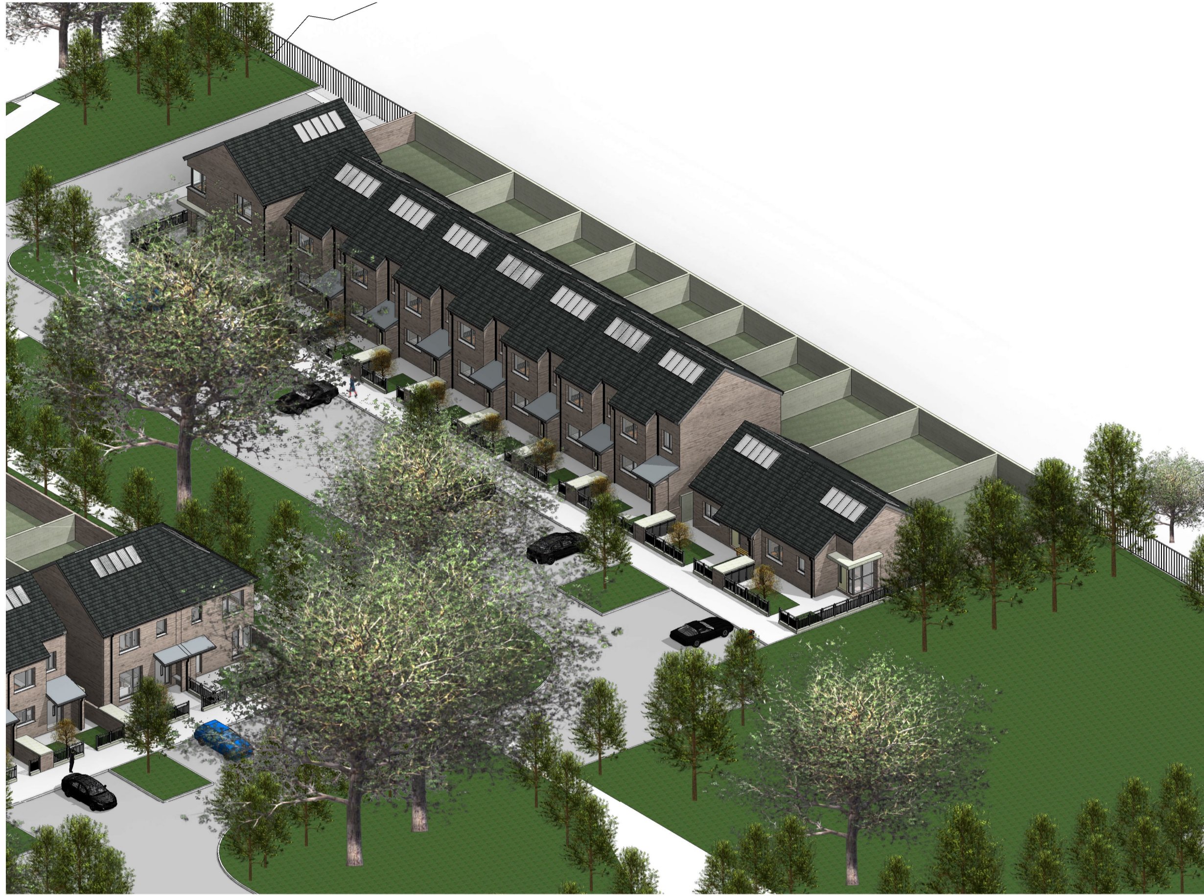
3D Axo View 1

Notes: Do not scale from this drawing. Use figured dimensions only. All errors and omissions to be reported to the Architect. This drawing to be read in conjunction with relevant consultant's drawings. All dimensions are in millimetres and all levels are in meters to match Datums unless otherwise noted. Contractor Design responsibility It is noted that there are many elements within the works that require contractor design, and will be subject to certification as part of BCAR – see Preliminary Inspection Plan for clarity on certification required. © This drawing or design may not be reproduced without permission.