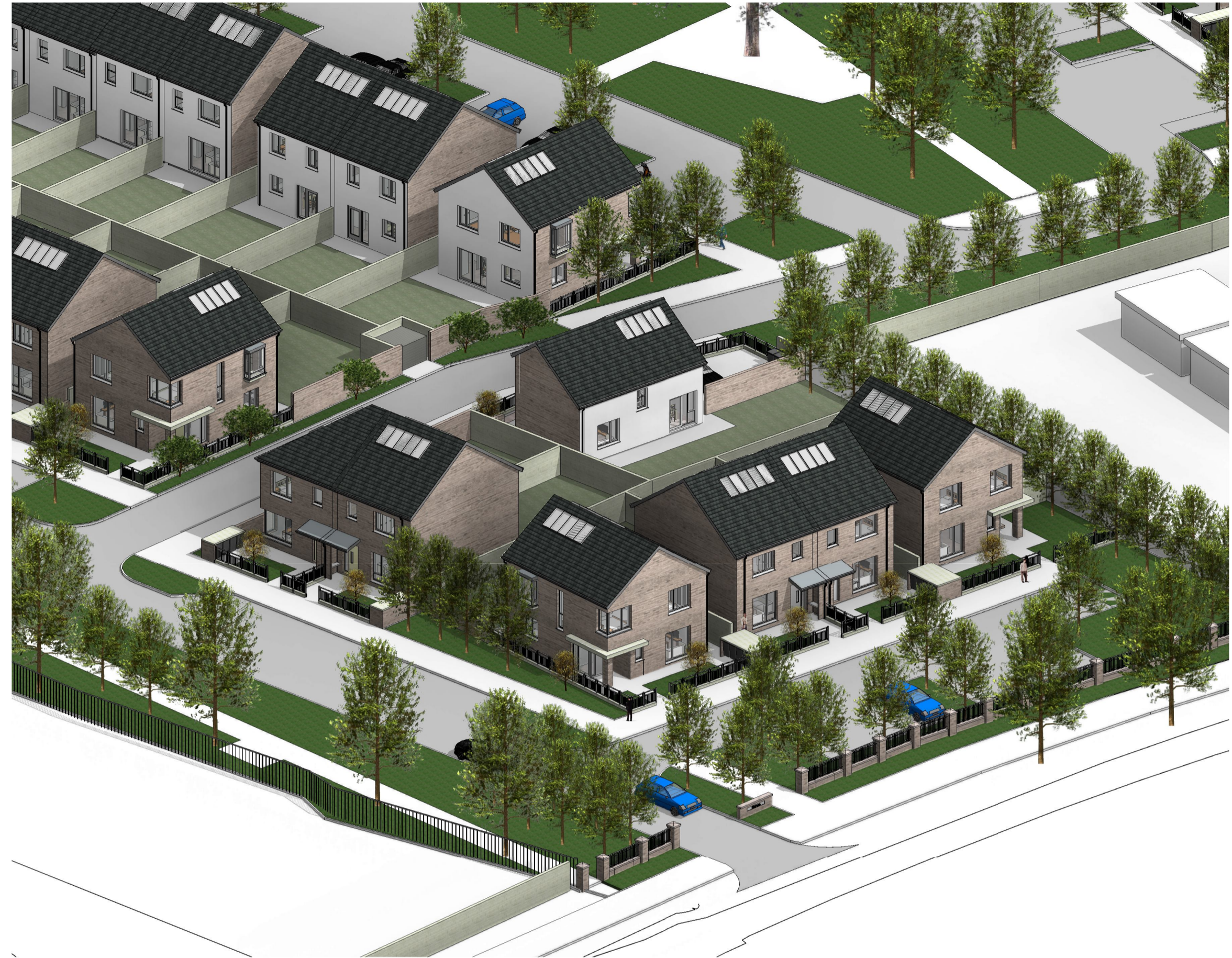
3D Axo View 2