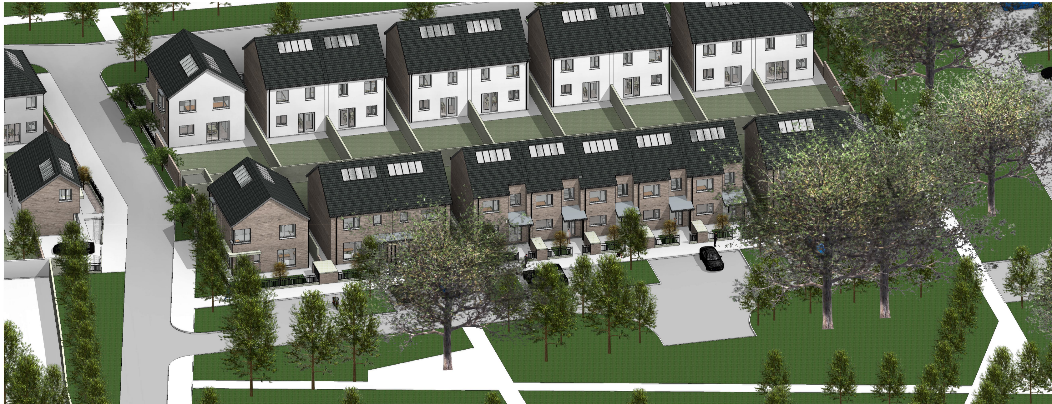
3D Axo View 3